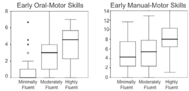
Figure 2 Box-and-whisker plots of early oral- and manual-motor skills